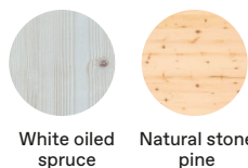
White oiled spruce